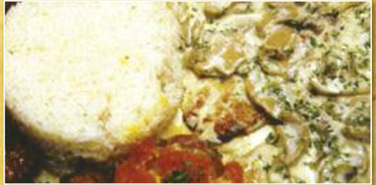
TILAPIA EN CREMA DE CHAMPIÑONES $11.59

Tilapia in Cream Wine Sauce with Mushrooms