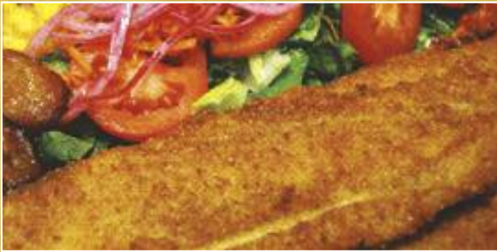
FILETE EMPANIZADO * $10.59

Grilled Flounder with Cream Wine Sauce & Garlic Shrimp