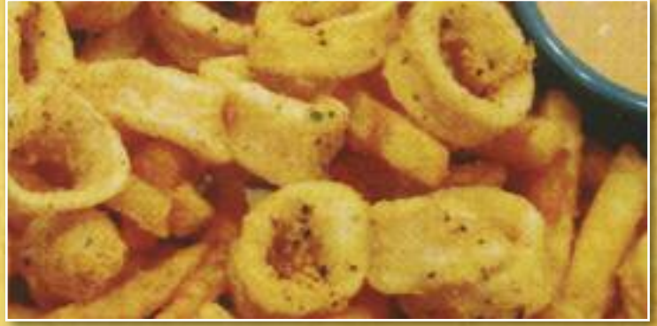
CALAMARES CON PAPITAS $9.59