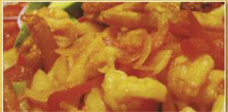
CAMARONES A LA CARIBEÑA $10.99

Sautéed Shrimp with Peppers & Onions in Sweet Sauce