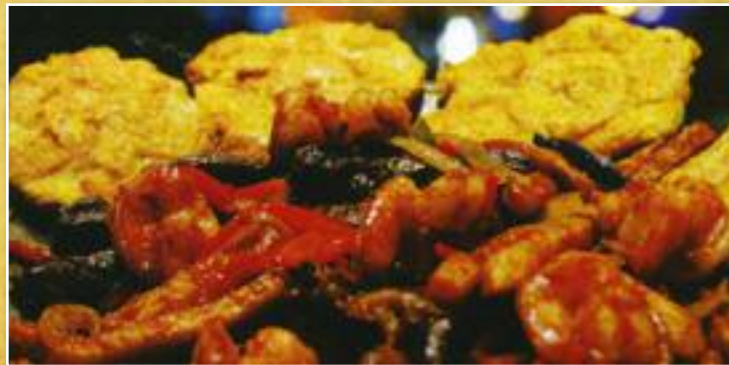
MAR Y TIERRA SALTEADO $14.99