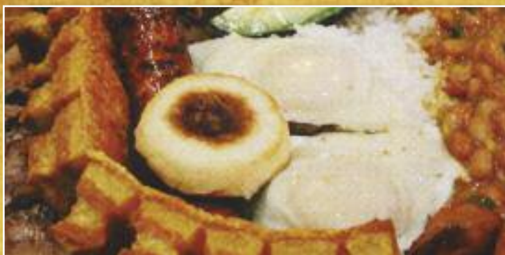
BANDEJA PAISA $15.99