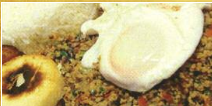
CARNE MOLIDA * $10.99