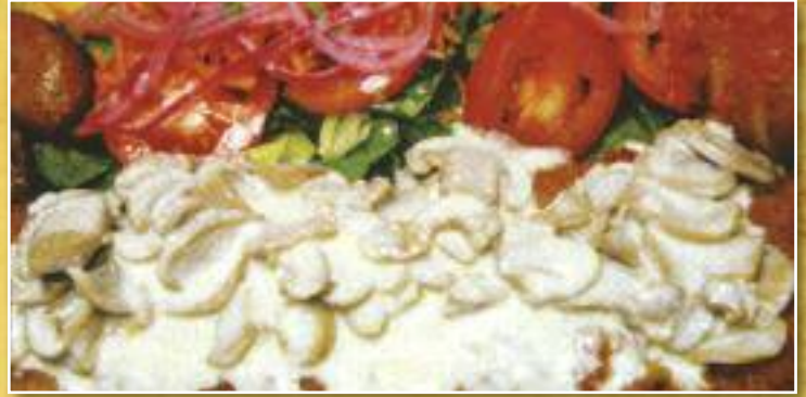
FILETE EMPANIZADO EN SALSA DE CHAMPIÑONES $10.99