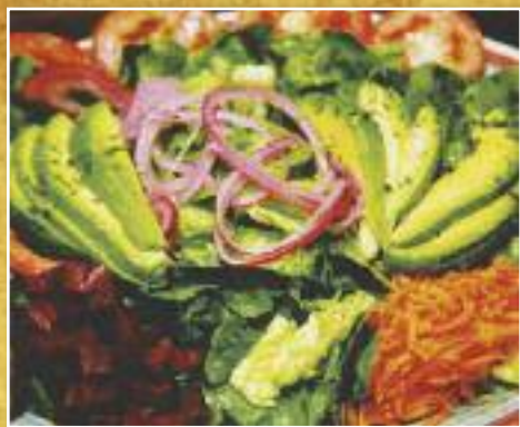
ENSALADA MIXTA $6.00