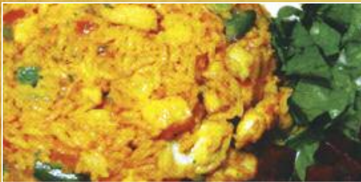
ARROZ CON POLLO * $10.99

Rice & Chicken Bits with Mixed Vegetables