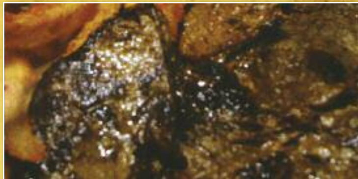
BABY BISTEC $7.99