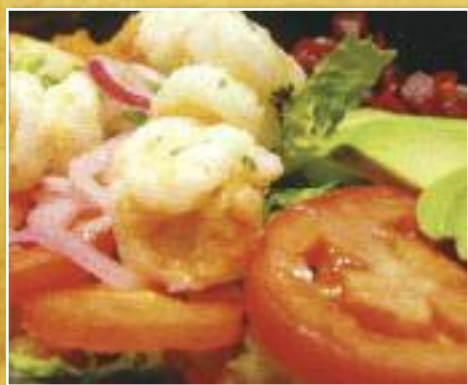
ENSALADA DE CAMARONES AL AJILLO $8.99