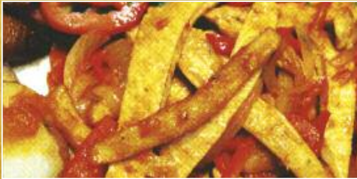
POLLO A LA CARIBEÑA * $ 10.99

Grilled Chicken with Shrimp in Wine Cream Sauce