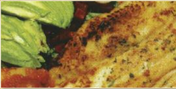
FILETE ASADO $11.59

Grilled Flounder Fillet with Garlic Butter