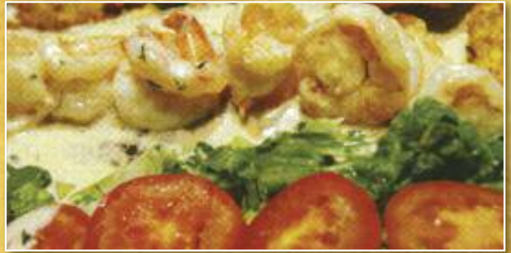
MAR Y MAR $11.99

Grilled Flounder Fillet with Garlic Butter