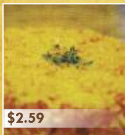
Arroz Amarillo Yellow Rice