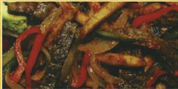
HÍGADO A LA ITALIANA * $9.99

Sautéed Beef Liver with Onions & Peppers