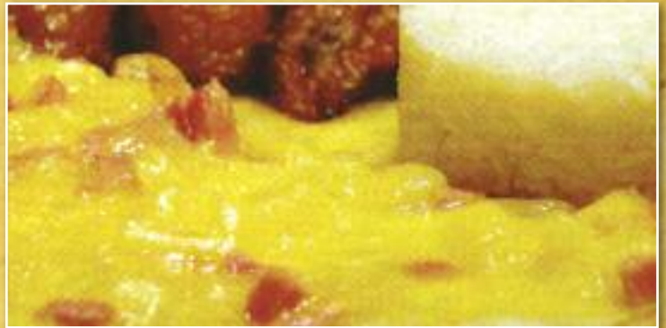
PECHUGA HAWAIANA * $11.59

Grilled Chicken Breast with Garlic Shrimp