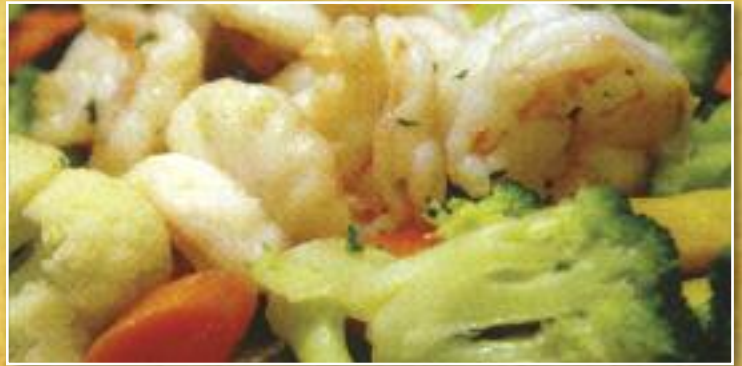
CAMARONES AL AJILLO CON VEGETALES $10.00