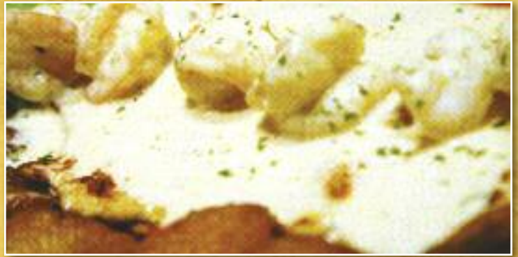
PECHUGA MARINERA $12.59

Grilled Chicken in a Wine Cream Mushroom Sauce