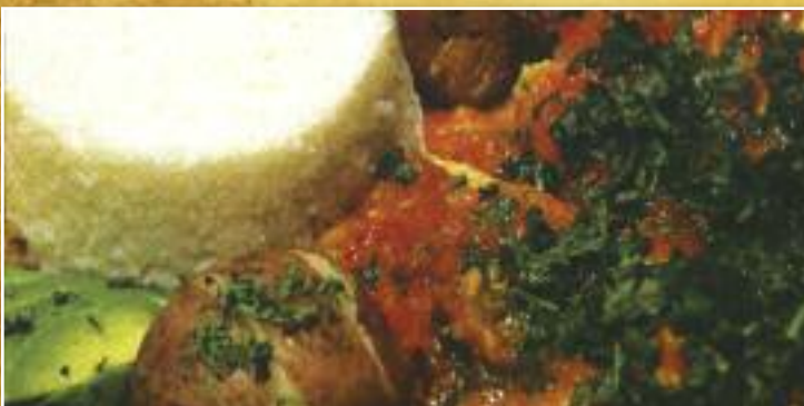
TILAPIA A LA CRIOLLA * $10.29

Tilapia in Cream Wine Sauce with Mushrooms