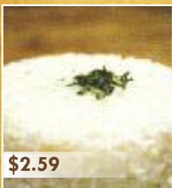
Arroz Blanco White Rice