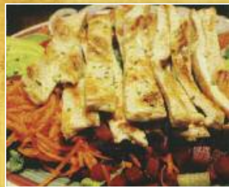
ENSALADA DE POLLO $6.99