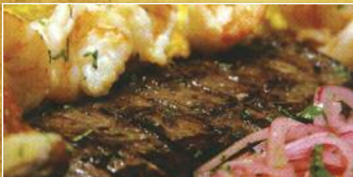
MAR Y TIERRA $14.99

Sautéed Beef Liver with Onions & Peppers