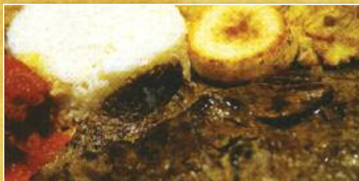
CARNE ASADA* $11.99