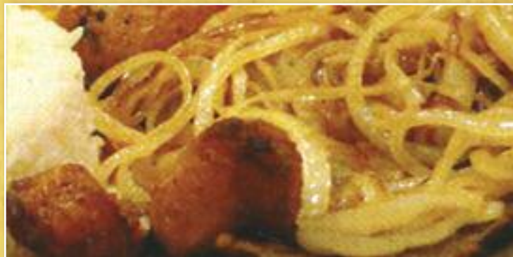
BISTEC ENCEBOLLADO * $10.99