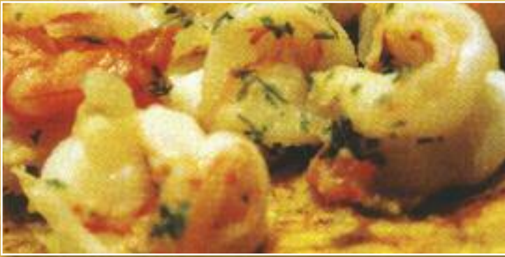
CAMARONES CON TOSTONES $8.99