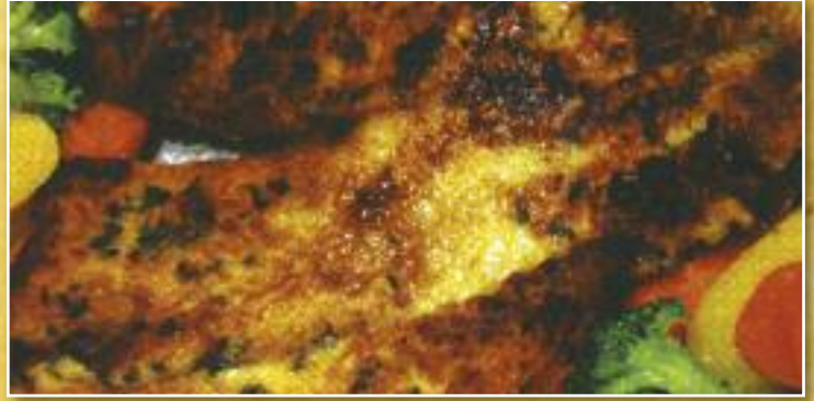
TILAPIA A LA PLANCHA CON VEGETALES $11.29

Grilled Skirt Steak with Sautéed Vegetables