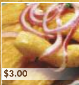
Yuca Fried Yucca