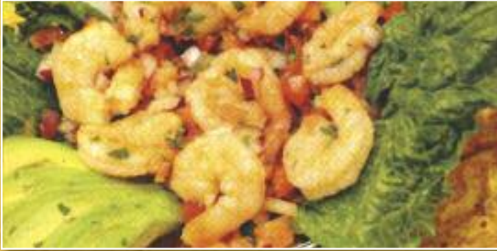
CEVICHE DE CAMARONES $12.00

Shrimp with Raw Salsa of Onions & Tomato