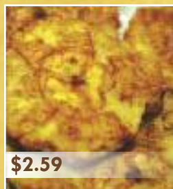
Tostones Fried Green Plantains