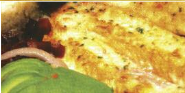
TILAPIA A LA PLACHA * $12.00