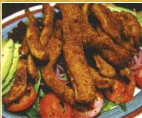
ENSALADA DE TIRITAS DE POLLO $7.29