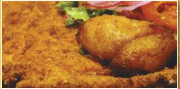
PECHUGA EMPANIZADA * $10.59

Rice & Chicken Bits with Mixed Vegetables