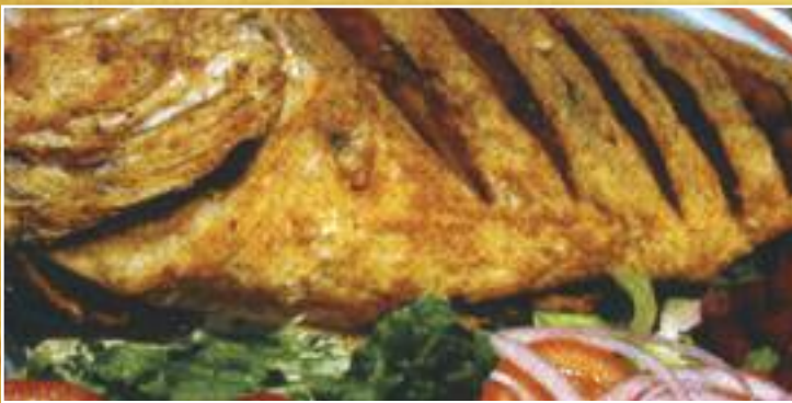
PARGO ROJO FRITO * $15.59