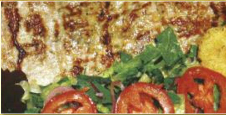
LOMO DE CERDO * $10.59