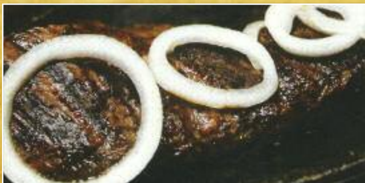
CHURRASCO * $18.59