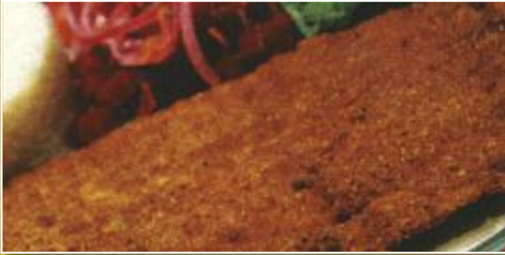
LOMO EMPANIZADO * $10.99

Pork Loin in Cream Wine Sauce with Mushrooms