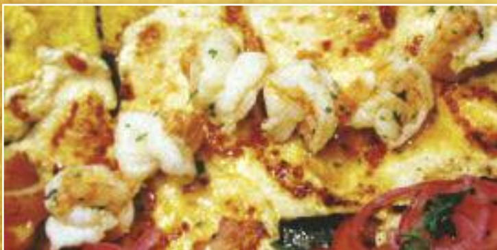
MAR Y POLLO $10.99

Grilled Chicken Breast with Garlic Shrimp