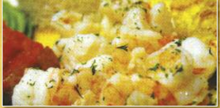
CAMARONES AL AJILLO * $11.59

Shrimp with Raw Salsa of Onions & Tomato