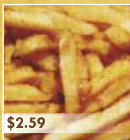
Papas Fritas French Fries