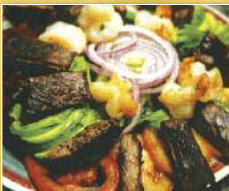
ENSALADA MAR Y TIERRA $11.99

Grilled Skirt Steak Strips & Garlic Shrimp Salad