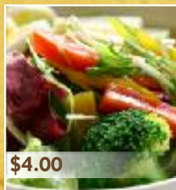
Vegetales al Vapor Steamed Veggies