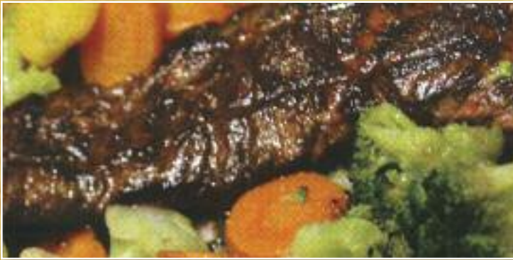
CHURRASCO A LA CARIBEÑA $12.59

Grilled Skirt Steak with Sautéed Vegetables