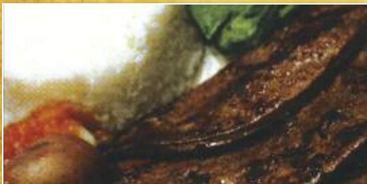
HÍGADO A LA PLANCHA * $9.59