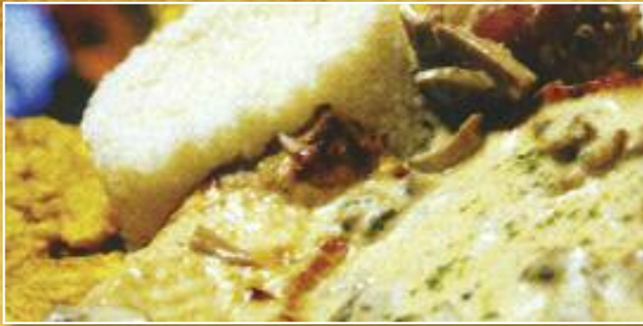
PECHUGA EN CREMA DE CHAMPIÑONES * $10.59

Grilled Chicken in a Wine Cream Mushroom Sauce