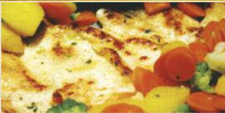
PECHUGA A LA PLANCHA CON VEGETALES $9.29