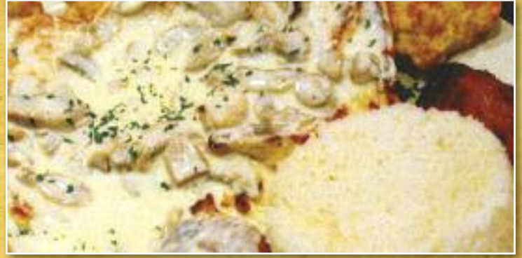
LOMO EN CREMA DE CHAMPIÑONES * $10.99

Pork Loin in Cream Wine Sauce with Mushrooms