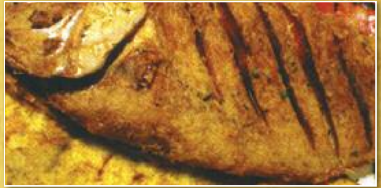
TILAPIA FRITA * $15.99