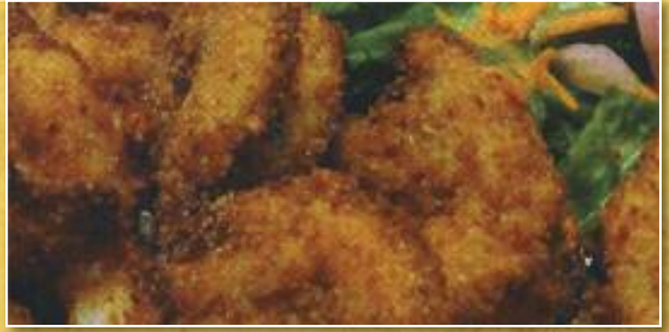
CAMARONES EMPANIZADOS * $11.59

Saffron Rice & Shrimp with Mixed Vegetables