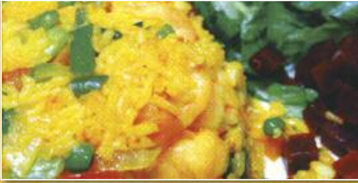
ARROZ CON CAMARONES * $11.99

Saffron Rice & Shrimp with Mixed Vegetables