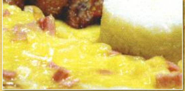
LOMO A LA HAWAIANA * $12.29