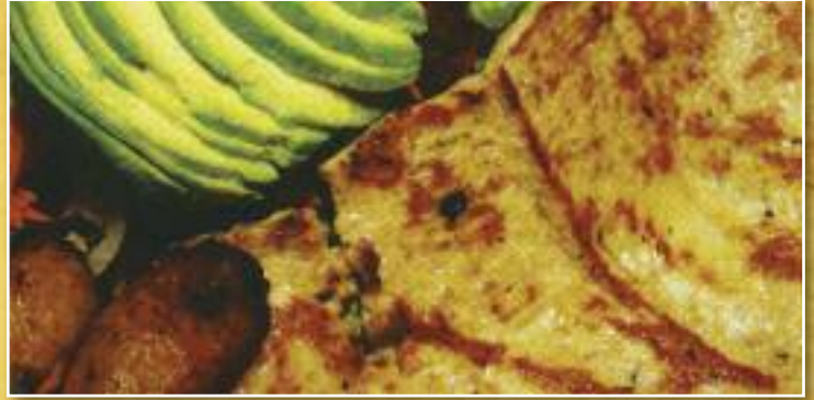
PECHUGA A LA PLANCHA * $11.00

Sautéed Chicken Strips in Sweet Sauce with Onions, Peppers & Fries